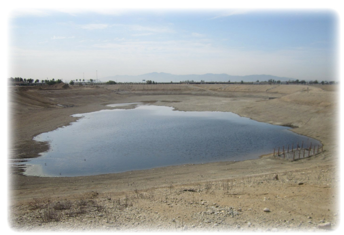
Turner Basin 4

Monitoring Activities. Watermaster and IEUA collect weekly water quality samples from recharge basins that are actively recharging recycled water and from lysimeters installed within those recharge basins. During this reporting period, approximately 184 recharge basin and lysimeter samples were collected and 27 recycled water samples were collected for alternative monitoring plans that include the application of a correction factor for soil-aquifer treatment determined from each recharge basin's start-up period. Monitoring wells located down-gradient of the recharge basins were sampled quarterly at a minimum; however, some monitoring wells were sampled more frequently during the reporting period for a total of 97 samples.