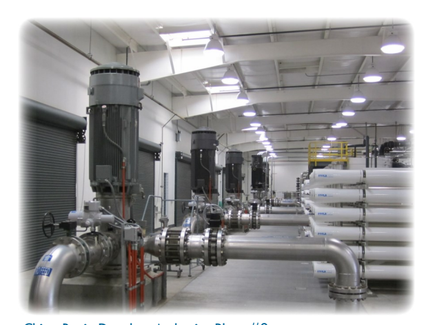
Chino Basin Desalter Authority Plant #2

All groundwater-quality data are checked by Watermaster staff and uploaded to a centralized database management system that can be accessed online through HydroDaVESM. Groundwater-quality data are used by Watermaster for: the biennial State of the Basin report; the triennial ambient water quality update mandated by the Basin Plan; and the demonstration of Hydraulic Control—a maximum benefit commitment in the Basin Plan. Data are also used for monitoring nonpoint source groundwater contamination and plumes associated with point source discharges and to assess the overall health of the groundwater basin. Groundwater-quality data are also used in conjunction with numerical models to assist Watermaster and other parties in evaluating proposed groundwater remediation strategies.